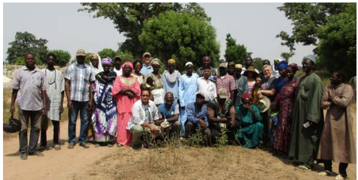
Groundswell International Global Conference, Senegal, Nov. 2017

Groundswell staff work with local partner organizations, who strengthen communities, who organize to transform lives. Our partners are: